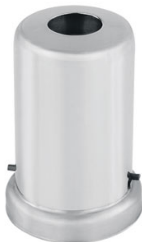
METHOT JAR WITHOUT LID HW-015-01 50 Ø x 75 mm