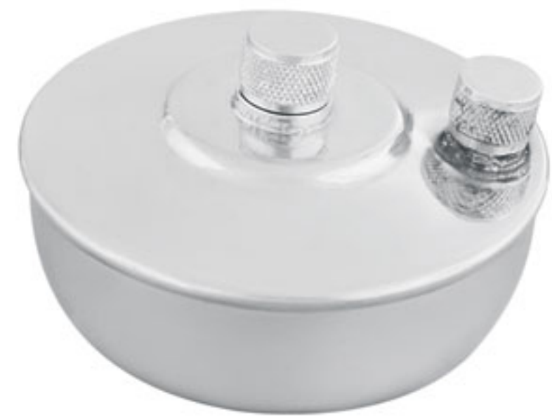
SPIRIT LAMP HW-013-03 120 ccm