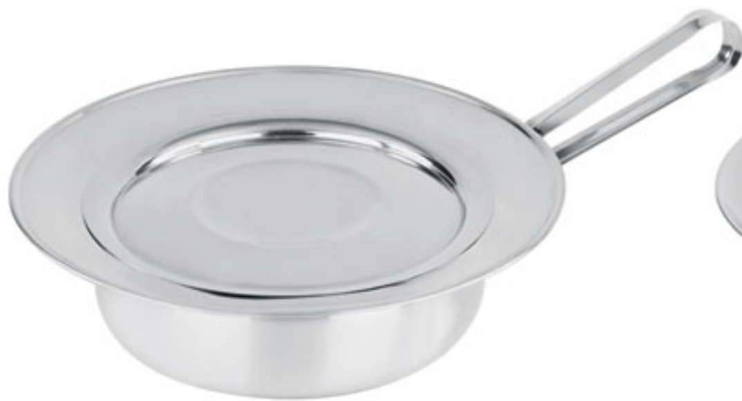
BED PAN HW-021-01 Ø 235 mm HW-021-02 Ø 320 mm