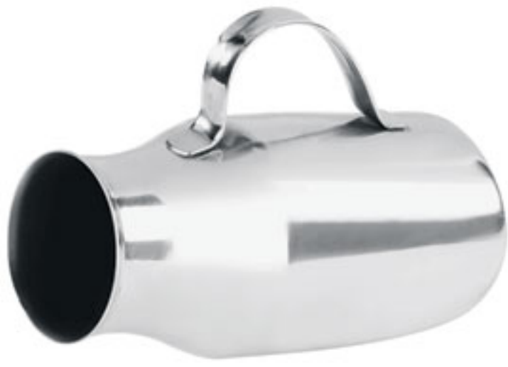
URINAL JUG HW-018-01 URINAL JUG