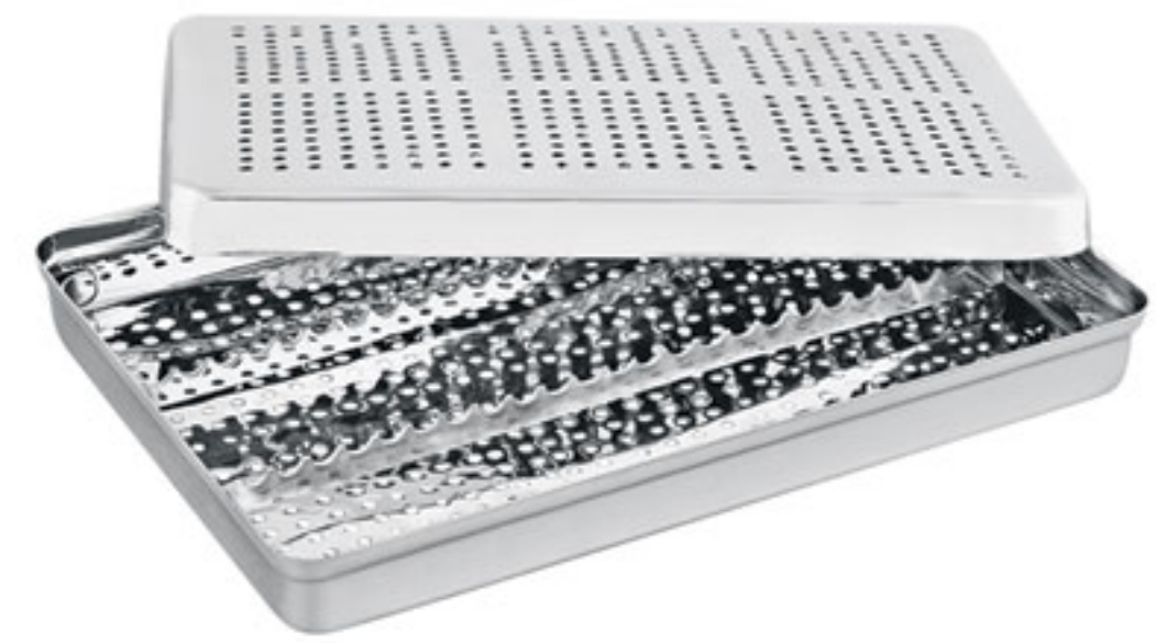
SCALAR BOXES HW-024-01 280 x 180 x 50 mm