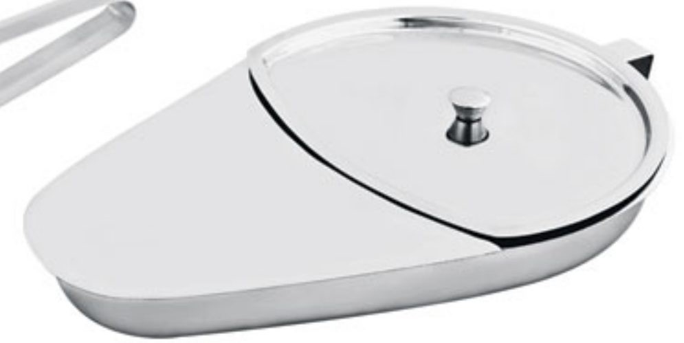
BED PAN HW-021-05 BED PAN