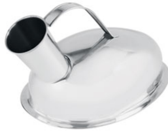
MALE URINAL HW-019-01 MALE URINAL