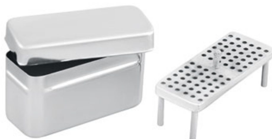
ENDO BOX HW-023-01 100 x 40 x 50