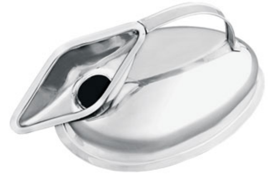
FEMALE URINAL HW-020-12 1200 ml