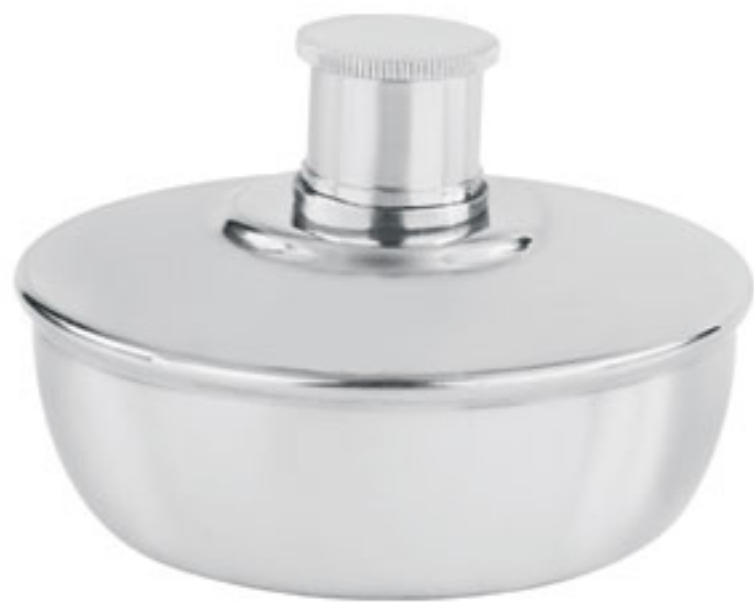
SPIRIT LAMP HW-013-01 120 ccm