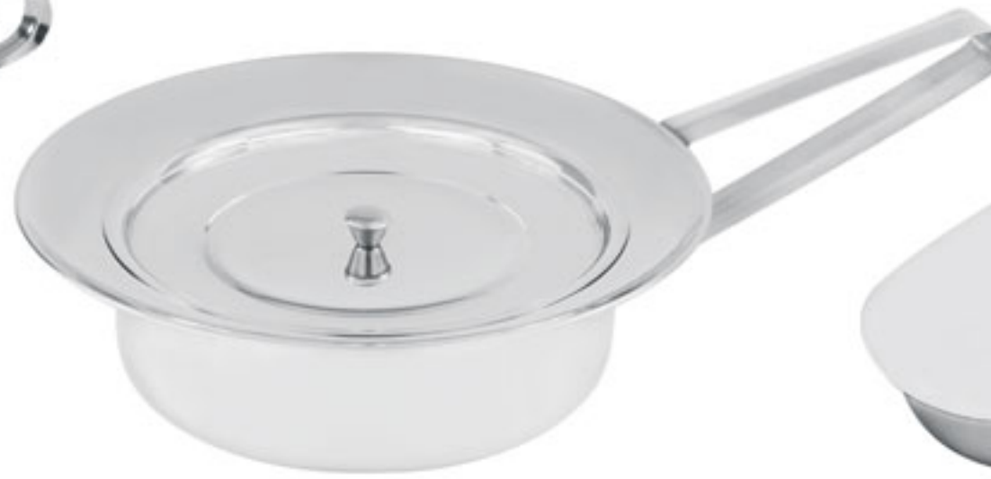
BED PAN HW-021-03 Ø 235 mm HW-021-04 Ø 320 mm