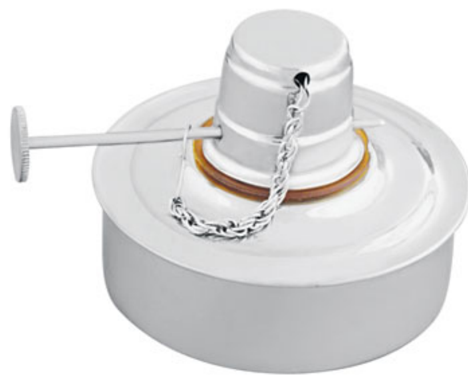
SPIRIT LAMP HW-013-02 120 ccm