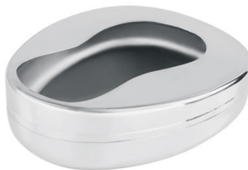
AMERICAN PATTERN BED PAN HW-021-06 BED PAN